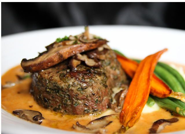
Grilled Filet of Beef with Lobster Beurre Blanc, Seasonal Wild Mushroom, Haricot Verts, Parsnip-Potato Purée and Roasted Carrots