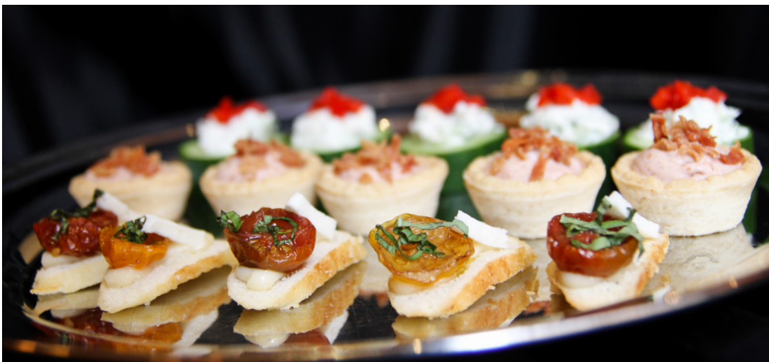
Oven Dried Mini Heirloom Tomatoes on Baguette with Fresh Mozzarella, Cherry Mousse with Crispy Prosciutto in Petite Tart, Cucumber Cup with Benedictine and Pimentos