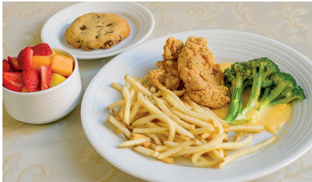
Children's Entrée: Chicken Fingers with Steamed Broccoli, French Fries, Fresh Fruit and a Freshly Baked Cookie