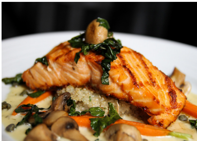
Grilled Salmon Beurre Blanc with Dill Lemon Caper Butter Sauce, served with Quinoa, Kale and Mushroom Sauté and Steamed Baby Carrots