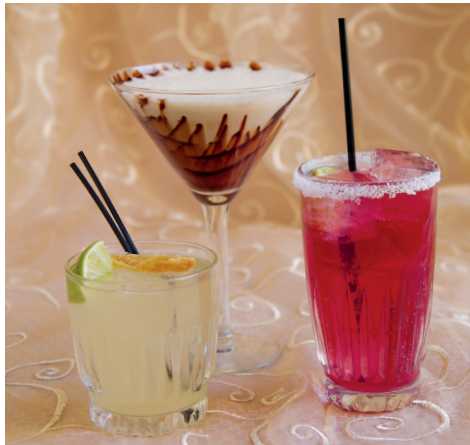
Moscow Mule, Chocolate Martini and Huckleberry Margarita