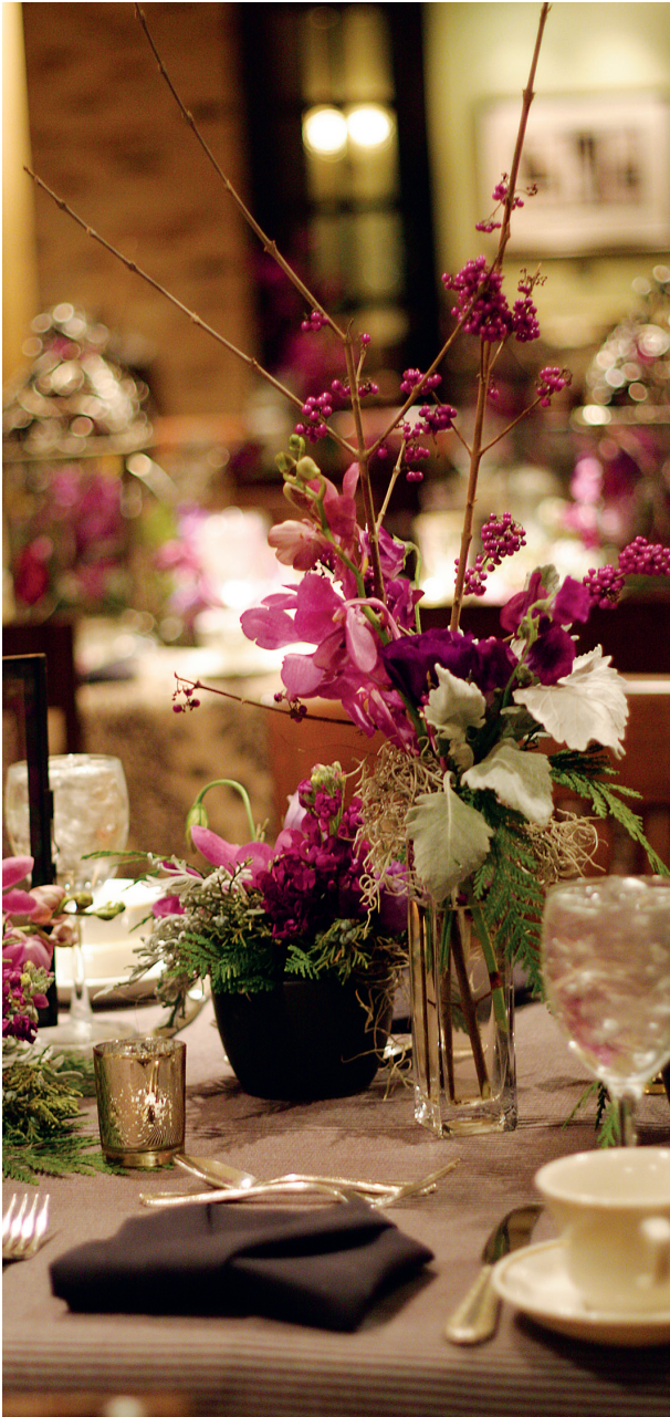
Reception in M ST. Cafe