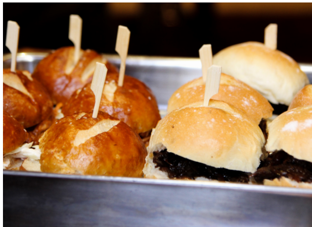
Pulled Pork and Short Rib Sliders