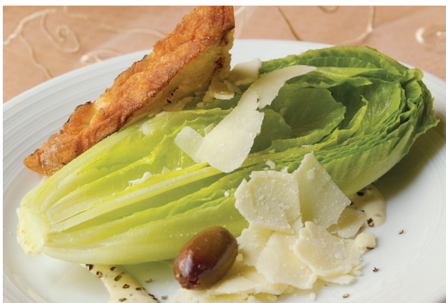
Hearts of Romaine with Grilled Herb Bread and Caesar Dressing

All entrées include freshly baked rolls, coffee, tea, iced tea and milk.