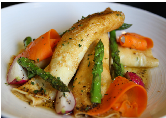
Savory Stuffed Crepe with Basil Ricotta Filling, Roasted Radishes, Asparagus and Shaved Carrots with a Brown Butter Sauce