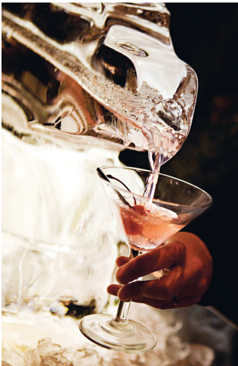
Ice Luge with Cosmopolitan